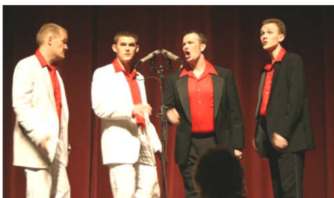
Night and Day placed third in the CSD collegiate quartet contest and qualified for the international collegiate quartet contest.