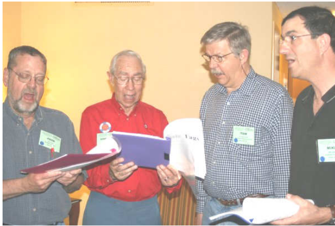
Barbershoppers get together to belt out a few tags at the headquarters hotel.