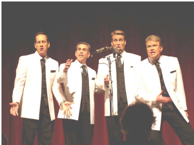
12 th Street Rag wowed the audience with their medalist-level performance.

Another regular CSD rep to international, 3 Men and a Melody , qualified out of district earlier -- also with top 10 scores -- so we'll have three district quartets in the Denver field to root for. But that's just part of the good news.