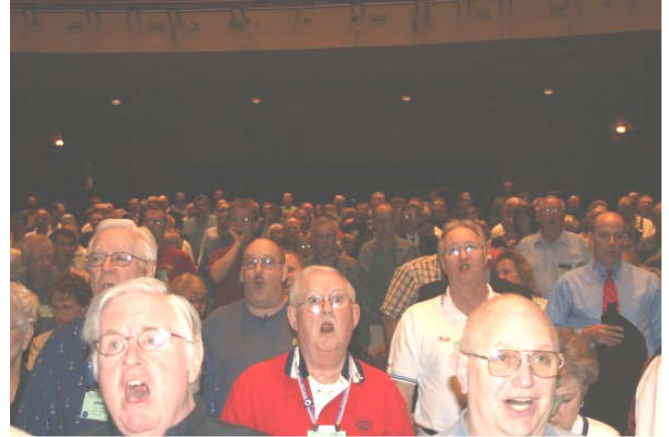
Everyone joins in singing “Keep the Whole World Singing” during the Spring Convention.