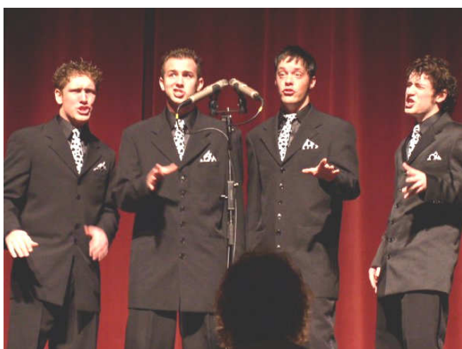
Smorgaschords placed fourth in the CSD collegiate quartet contest and qualified for the international collegiate quartet contest.