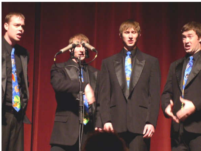
Downpour placed second in the CSD collegiate quartet contest and qualified for the international collegiate quartet contest.