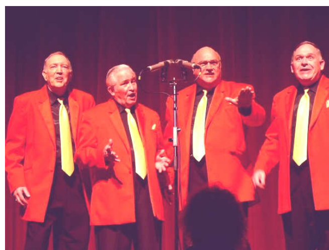
Been There was crowned the CSD Senior Quartet Champions at the CSD Spring Convention.