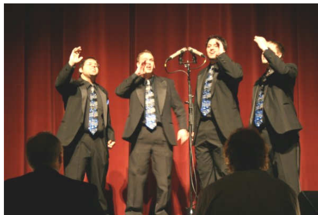
Blue Notes took top honors at the CSD collegiate quartet contest and qualified for the international collegiate quartet contest in Denver.

put them third in the regular contest. They led a field of four CSD collegiate quartets who scored high enough to earn a trip to Denver, and a fifth in the field of seven could well earn a wildcard invitation. In fact, the level of the collegiate competition was the buzz of the Sioux Falls convention. (Look for all the contest scores on the district web site: www.centralstatesdistrict.com ).