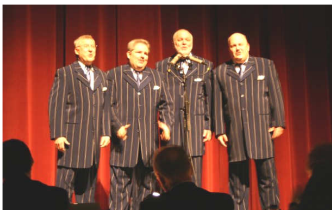
The Noise Boys are headed back to international.

Don't forget this is the year that our 2004 gold medal chorus champs, St. Charles Ambassadors of Harmony , return to international competition, where they will be joined by Kansas City's Heart of America Chorus . The field in Denver has been expanded to 30 choruses for this first time this year, so it's going to be a long but exciting two rounds, with AOH arguably the favorite; let's go cheer everyone on. (I understand the Ambassadors are gonna have about 500 singers on stage!)