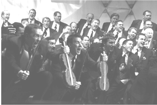
The Ambassadors of Harmony perform "Fit As A Fiddle" at the International chorus contest in Denver, Colorado.